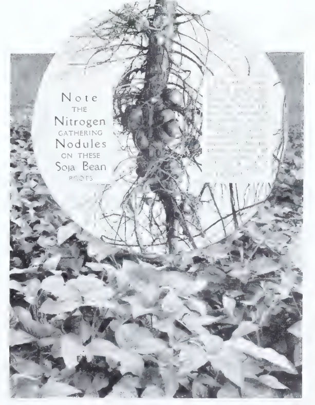
EARLY WILSON BLACK SOJA BEAN

Quantity Per Acre: Sow if alone 150 lbs. per acre; if with oats or barley 100 lbs. of Peas and 1 bushel of the other chosen grain. Price, lb. 30c.; 10 lbs. $2.00; 50 lbs. $4.50; 100 lbs. $8.00.